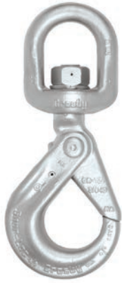
S-1326 SWIVEL HOOK