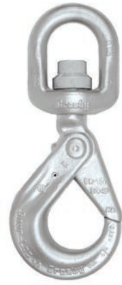
S-13326 SWIVEL HOOK with BEARING