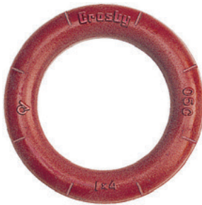
S-643 Weldless Rings