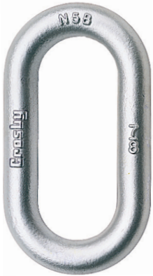
G-340 / S-340 Weldless End Link