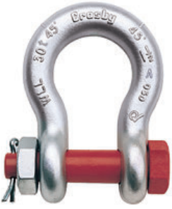
G-2140 / S-2140

G-2140 meets the performance requirements of Federal Specification RR-C-271F, Type IVA, Grade B, Class 3, except for those provisions required of the contractor. For additional information, see page 452.