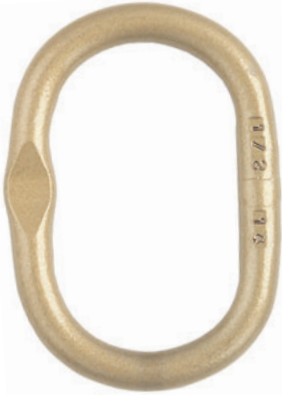
A-344 Welded Master Links

Ultimate Load is 5 times the Working Load Limit. Applications with wire rope and synthetic sling generally require a design factor of 5. Based on single leg sling (in-line load), or resultant load on multiple legs with an included angle less than or equal to 120 degrees. ** Proof Test Load equals or exceeds the requirement of ASTM A952(8.1) and ASME B30.9. For use with chain slings, refer to page 240 for sling ratings and page 245 for proper master link selection.