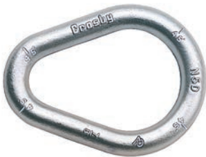
G-341 / S-341 Weldless Sling Link

*Based on single leg sling (in-line load), or resultant load on multiple legs with an included angle less than or equal to 120°. Minimum Ultimate load is 5 times the Working Load Limit. †† Welded Link.