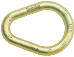
A-341 Alloy Pear Shaped Links