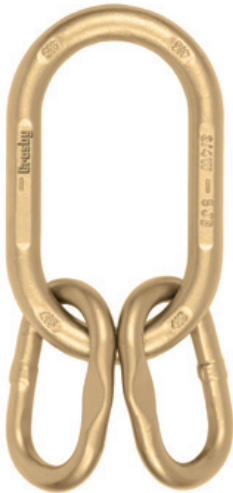
A-345 Alloy Master Links