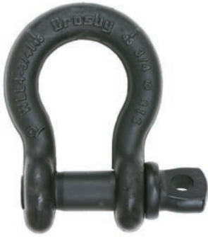
S-209T THEATRICAL SHACKLE