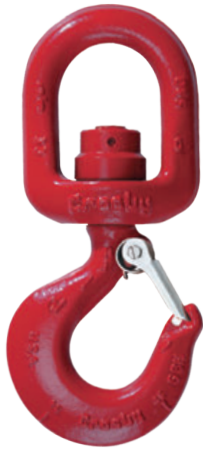
L-3322B Swivel Hooks with Bearing

New anti-friction bearing design allows hook to rotate freely under load.