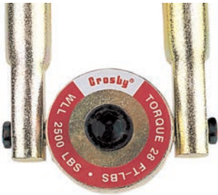
HR-125 Swivel Hoist Ring